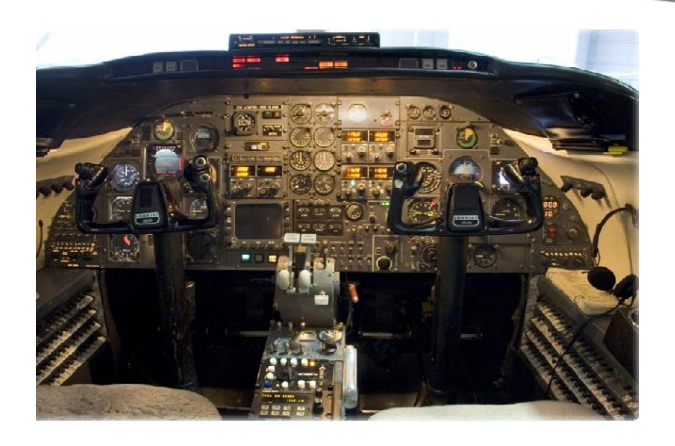
Aircraft Subject To Prior Sale Or Withdrawal From The Market Specifications Subject To Verification UponInspection