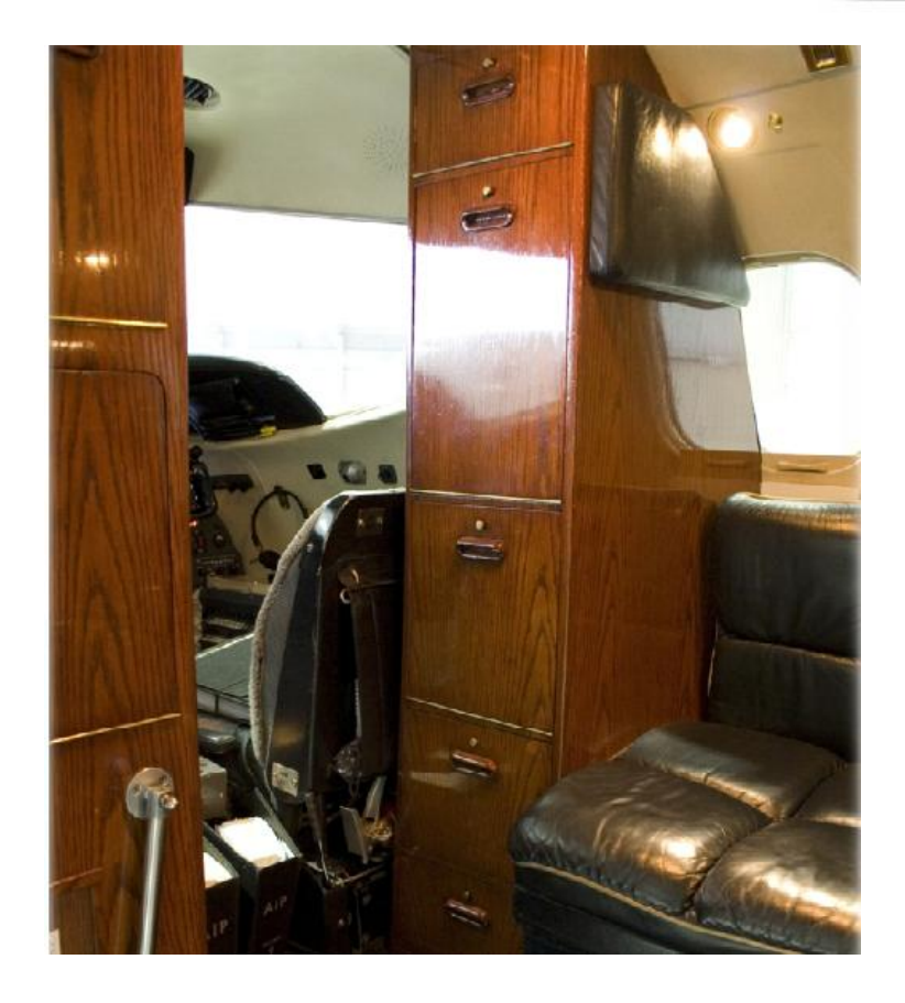
Aircraft Subject To Prior Sale Or Withdrawal From The Market Specifications Subject To Verification UponInspection